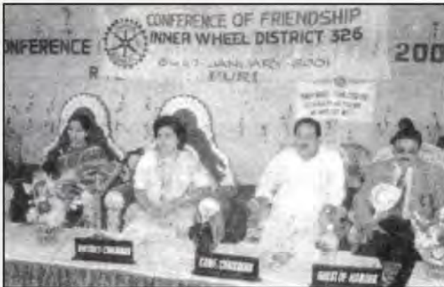
A Golden moment shared with IIW (2007-08) with the Education Minister